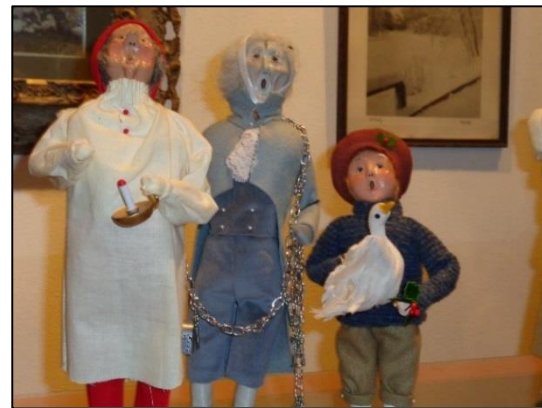
Left to right: Scrooge, Ghost of Christmas Past and Tiny Tim.