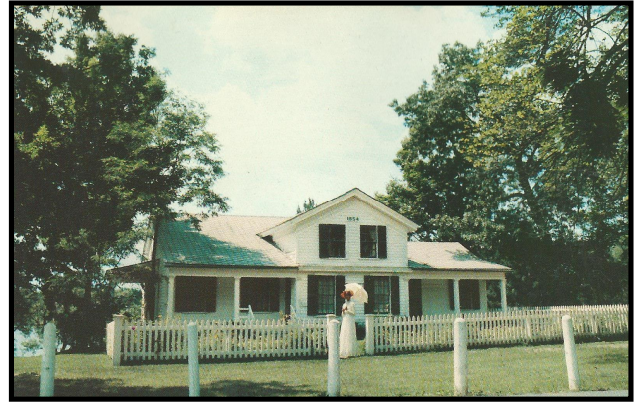
Waupaca Historical Society Postcard Collection

As the warm weather appears, volunteers at the Hutchinson House are getting the building ready for summer visitors. The historic house, located in South Park, will open for the season on Saturday, May 28 th .