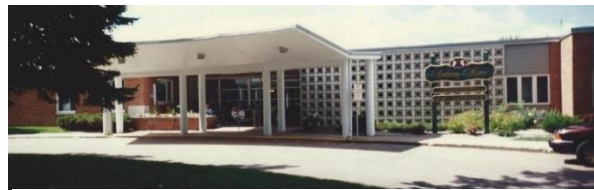
The Bethany Home in the 2000's.