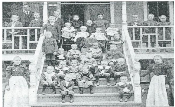
The Children's Home in the 1900's.

In Chapter Four (Bethany Events from 1980 – 1997) the articles, photos, and brochures highlight the expansion of the Bethany campus to include an 'Extended Living and Nursing Home', 'Assisted Living Apartments' and 'Independent Living Duplexes'.