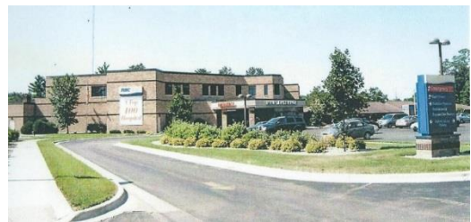
Riverside Medical Center and ThedaCare Physicians.