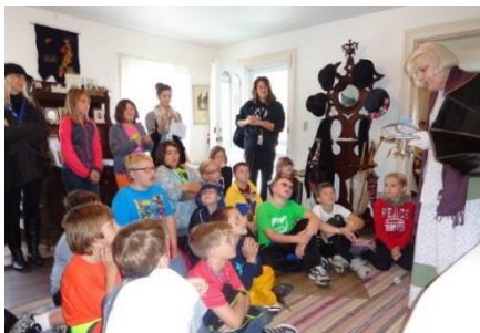
Curator Wiese introducing the 'greeting room'.