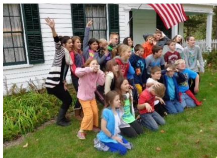
Just before parting, a silly class photo.