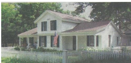
Pre-Fall-O-Rama photo in the Waupaca County Post, September 11, 2014.