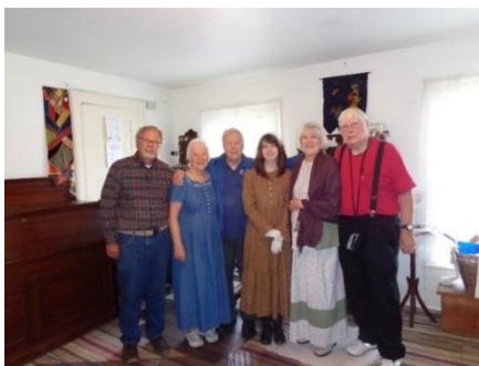
The HHM docent team ready to guide – for better or worse.