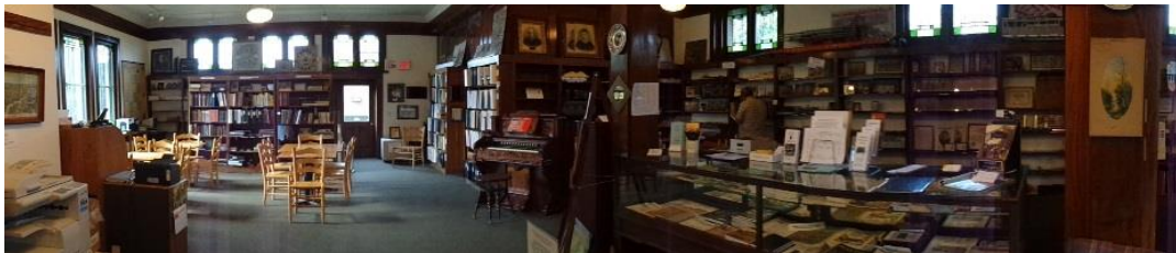
Panoramic view of the inside of the upstairs of the Holly History and Genealogy Center.