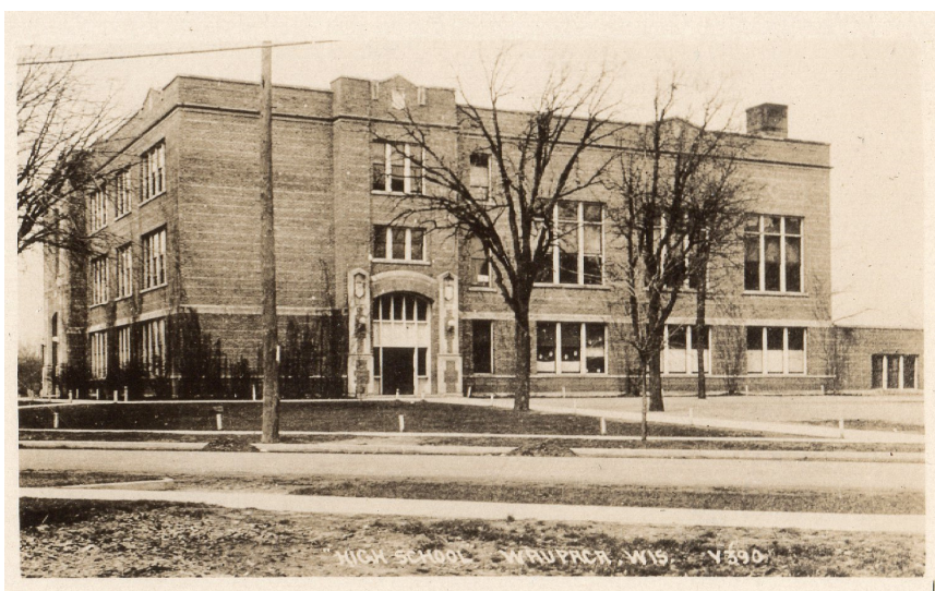
The staff and students at the Waupaca High School (pictured above) were interested in starting a boxing program in 1945.