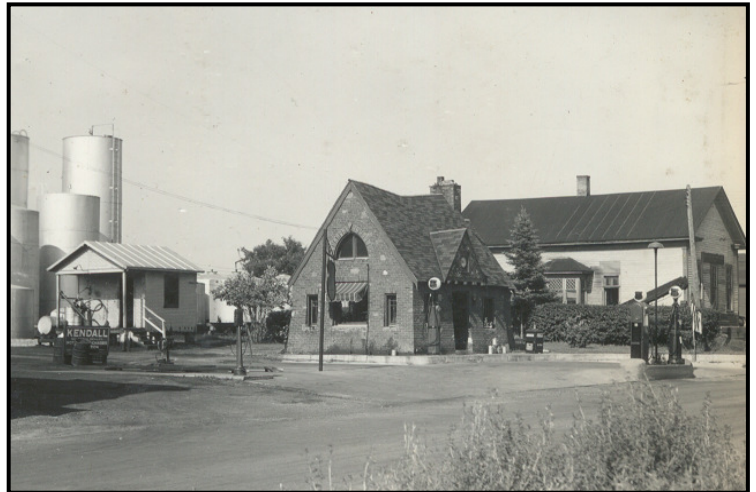
The Czeskleba office and filling station was located on Mill Street. The Czeskleba filling station on E. Fulton Street remains today as RE/MAX Lyons Real Estate.