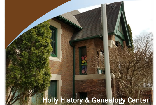
Holly History & Genealogy Center