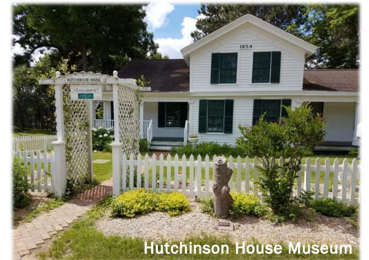
Hutchinson House Museum